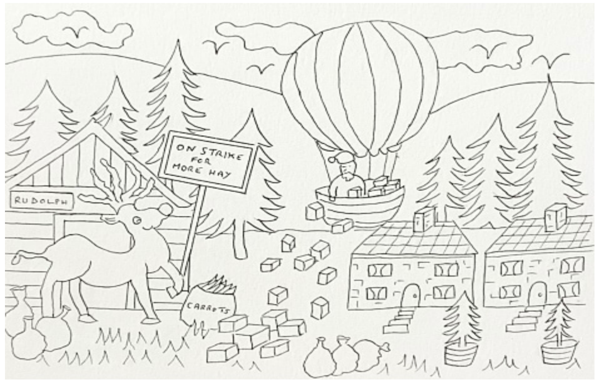
Santa has found other means of delivering the presents this year!

There are 5 points available for colouring in the picture and a further five points for providing the alternative caption.