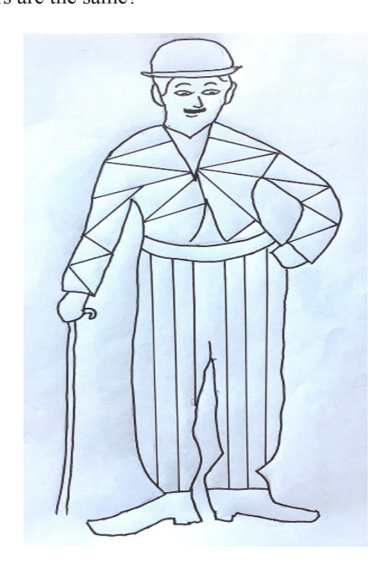
There are 5 points for providing Charlie with a more colourful suit

Are you able to brighten him up by colouring in his suit, using three colours only, so that no adjoining colours are the same?