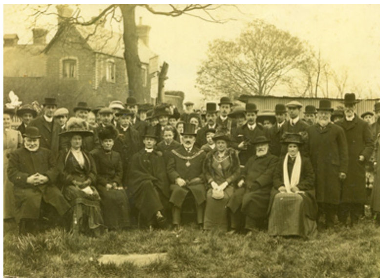
Laying the Foundation Stone of the new Wesleyan Church. Thursday, April 11 th 1912